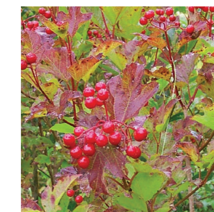
Caor Chon Guelder Rose