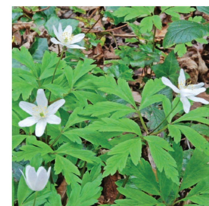
Lus na Gaoithe Wood Anemone