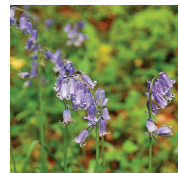
An Cloigín Gorm Bluebell