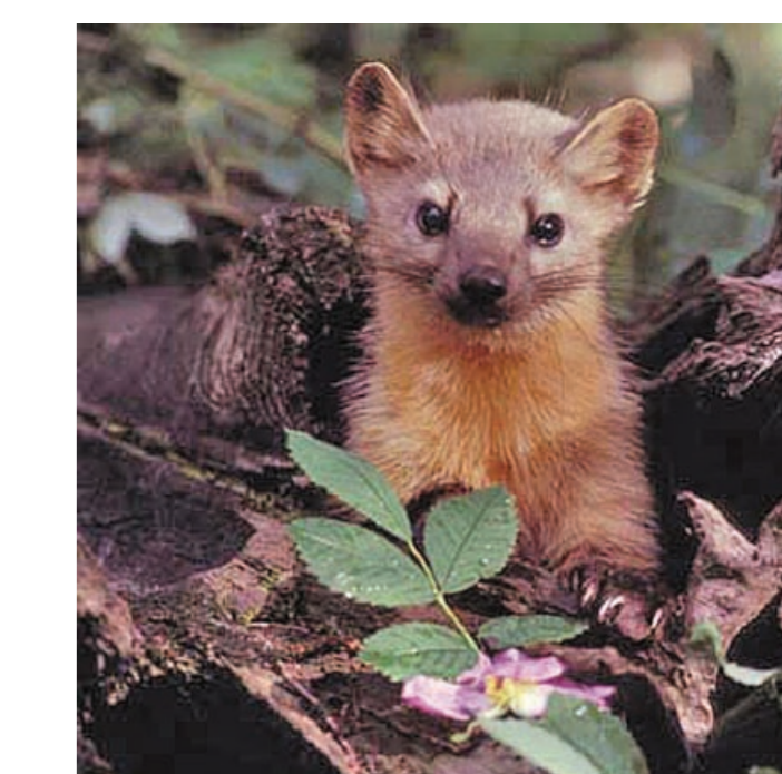
Cat Crainn Pine Marten