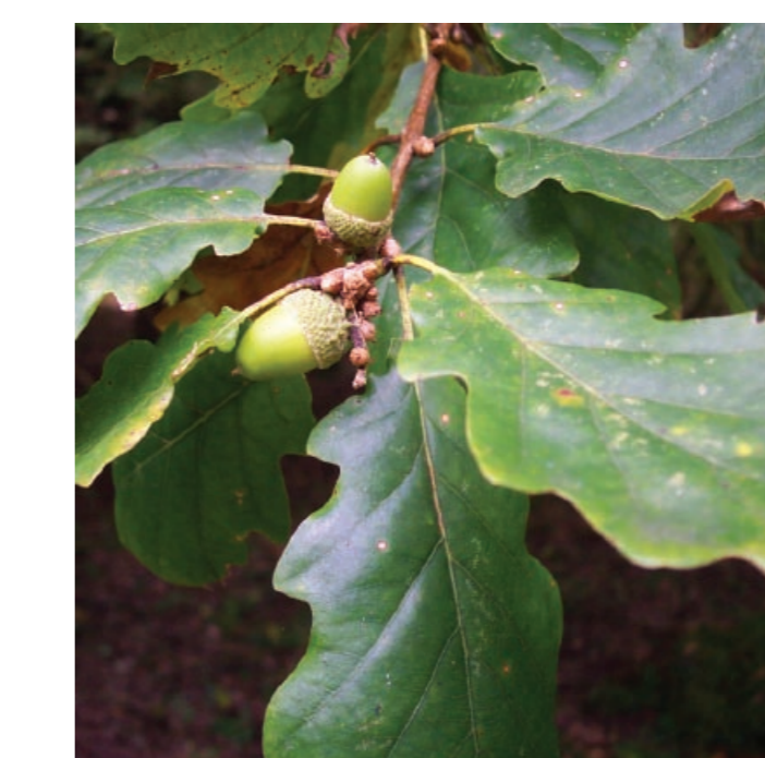
An Dair Neamhghasánach Sessile Oak