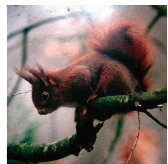
Iora Rua Red Squirrel