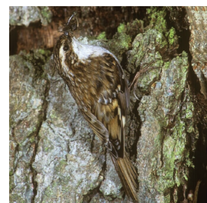
An Snag Tree Creeper